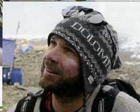
DITA NUOVA 01

himself, spoke about the formative role sports can play in a person's development. "Sports have an important moral and educative significance," he said. "They are training grounds for virtue, a school for inner balance and an outer control, an introduction to true and lasting conquests. Physical effort thus becomes a rigorous training in human and Christian virtues. As early as the first centuries, Christian theologians opposed a certain ideology